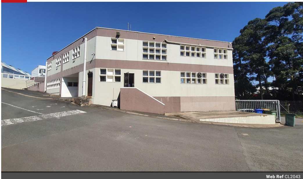
Web Ref CL2043